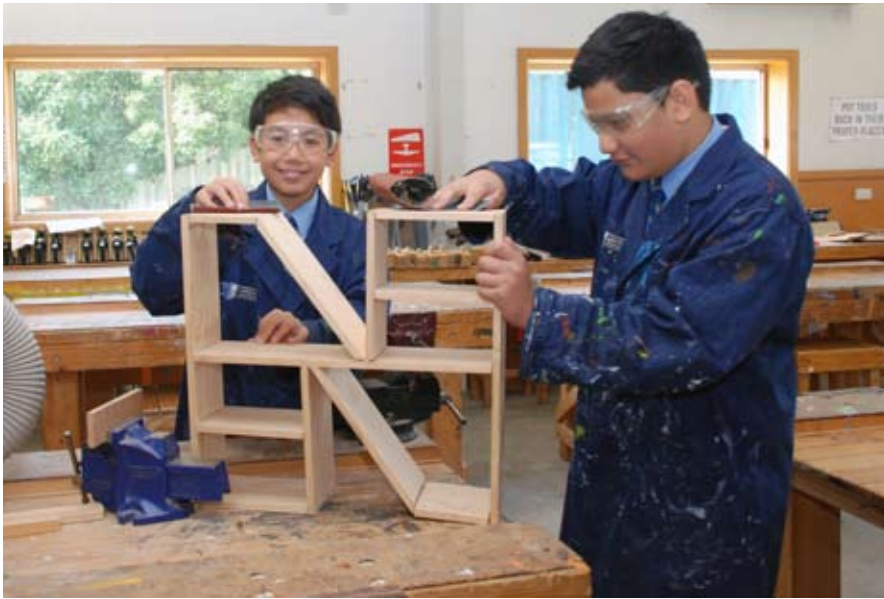
Wood Technology students at work