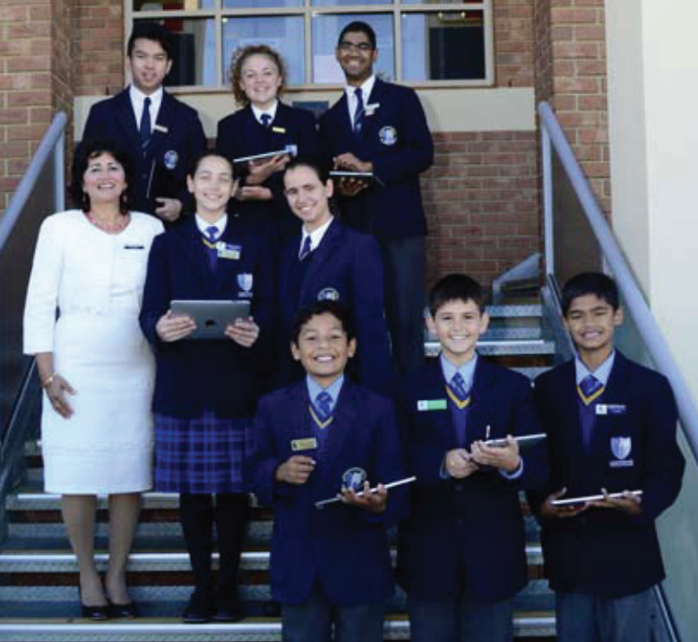
Students utilising technology from the iPad program