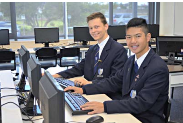
Senior students using computers to support their learning