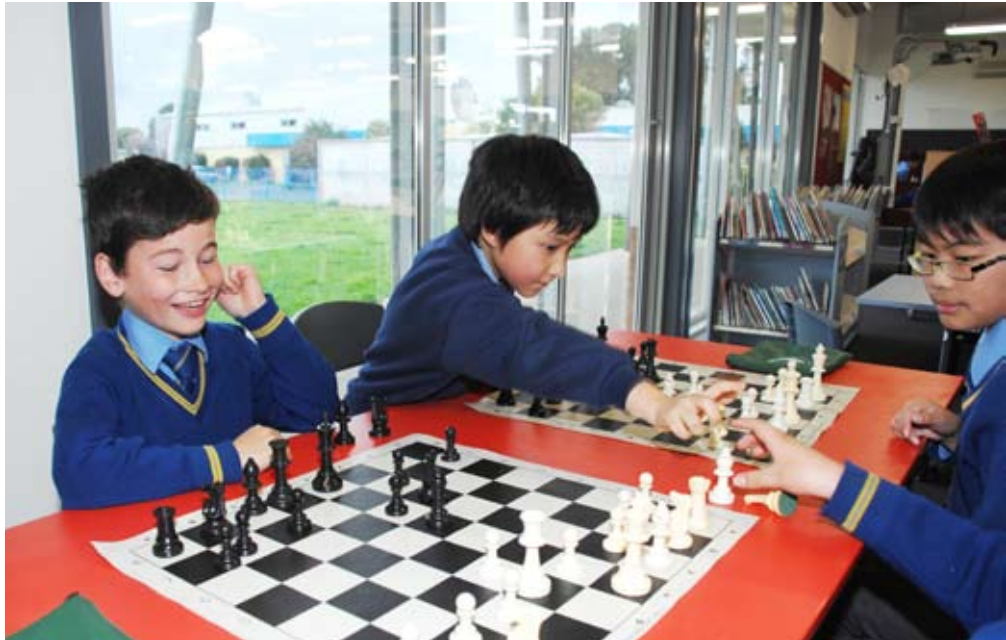
Members of the Primary School Chess Club