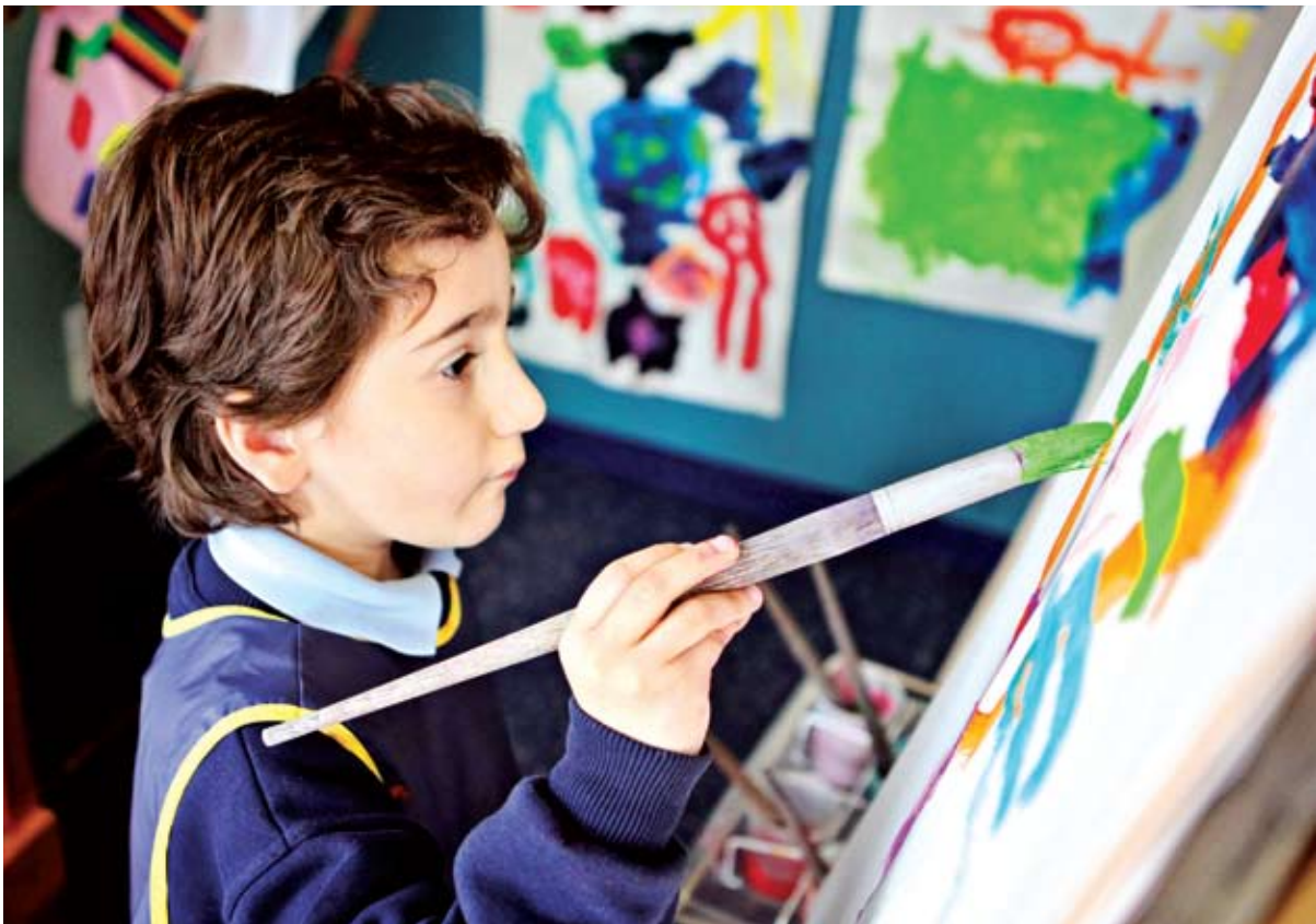
Creative expression in the Early Learning Centre