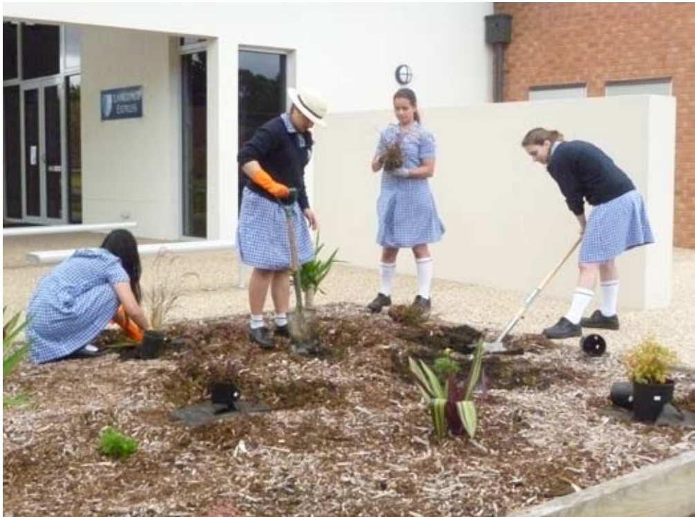
VCE Science students exploring plant growing