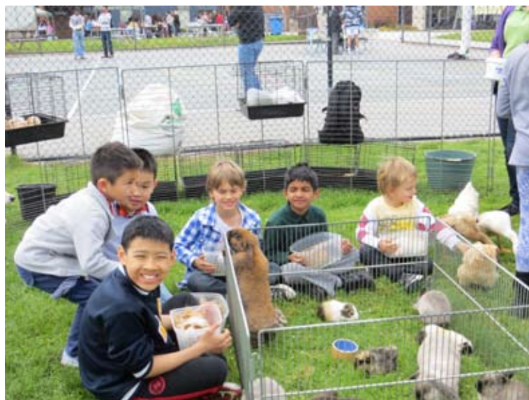
Enjoying the entertainment at our annual International Food Festival