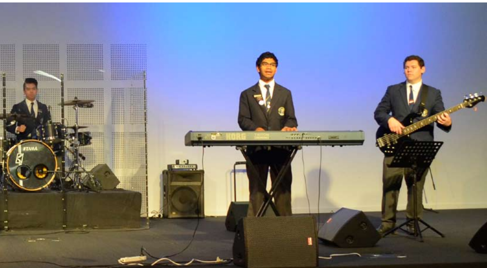
Senior students lead Chapel