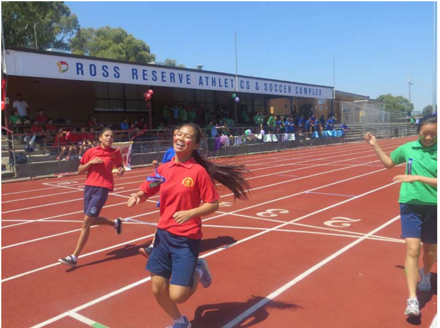
Secondary students House Athletics Carnival