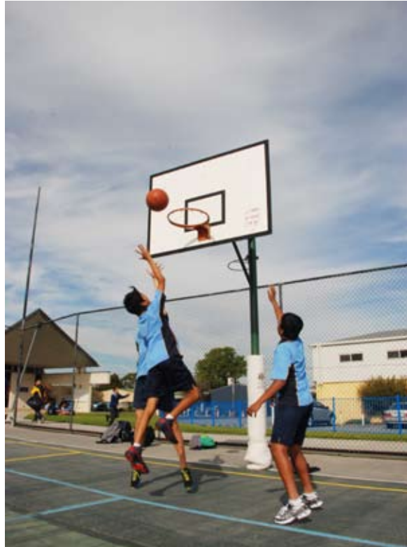
Secondary students playing basketball during sport time