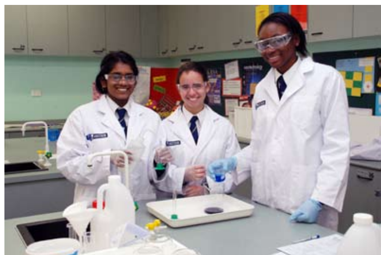
Science facilities utilised for VCE subjects