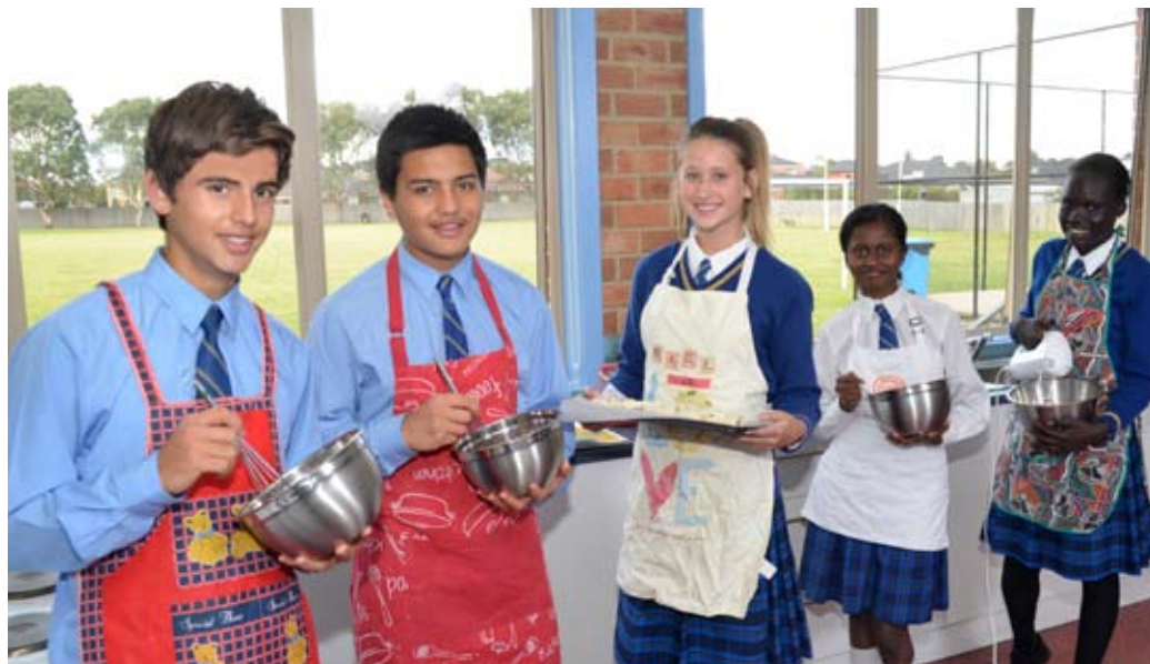
Our Home Economics facility allows students to extend their skills and knowledge about food preparation

Students are taught in a caring Christian environment that encourages them to develop a relationship with God and to place their faith and trust in Him.