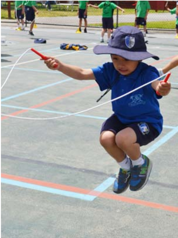
Primary school students enjoying skipping in the “Jump Rope for Heart” program