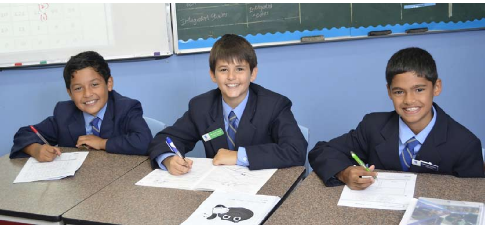
Students at work

This explicit teaching and learning program: