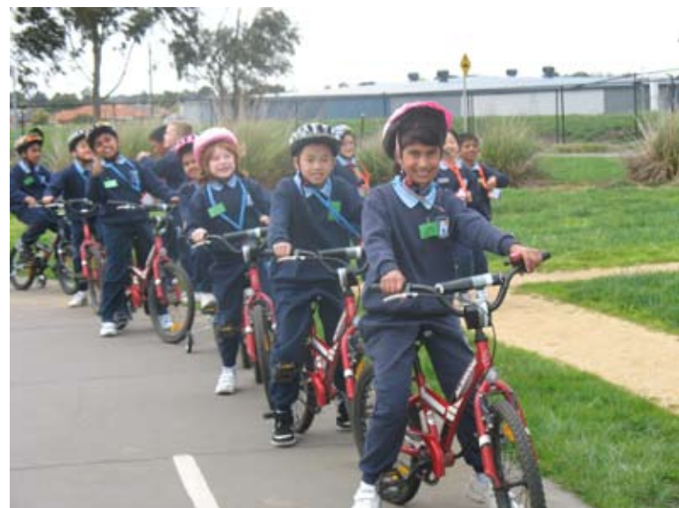
Learning bicycle safety on a Grade 2 excursion to Casey Safety Village